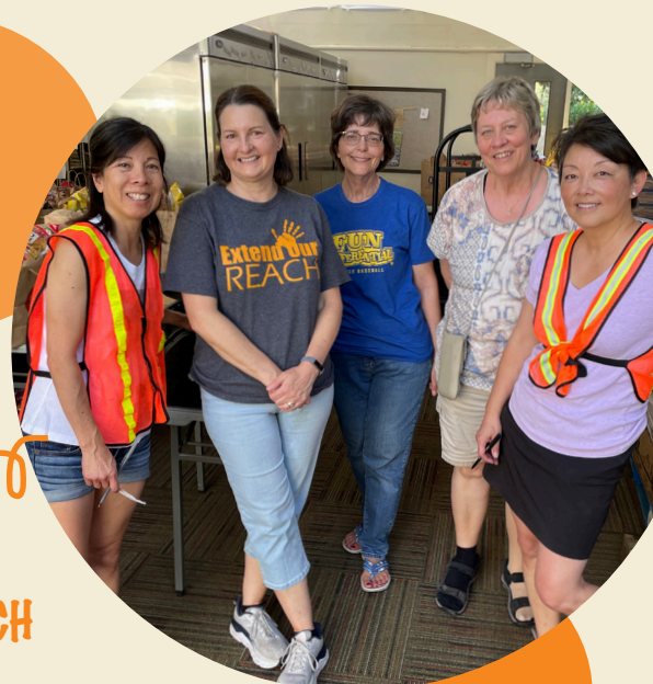
Jubilee REACH Volunteers

Thank you for actively loving our neighbors, listening to their stories, and walking alongside them in the middle of their unfinished stories.