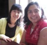
It's what we do