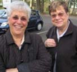
It's who we are