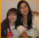
It's what we do