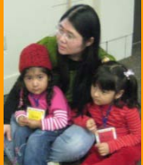
It's who we are